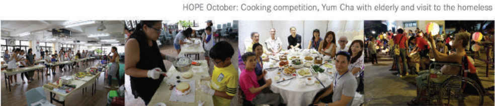
HOPE October: Cooking competition, Yum Cha with elderly and visit to the homeless

For other questions, please contact info@islandecc.hk