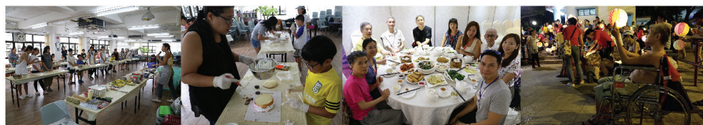
HOPE October: Cooking competition, Yum Cha with elderly and visit to the homeless

✂ TEAR OFF THIS CORNER AND PLACE INTO THE OFFERING BAG Want to learn more about us? Name _____ Email _____ Phone _____