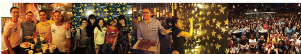
All Stars Volunteer Appreciation Party

Have you ever wondered how you can understand the Bible in a systematic way and learn to apply the Word of God in your life? This 5-week class will teach you the basic principles and methods of Bible Study. Starts 15 October, 11:30 am - 1pm, 7/F Classroom.