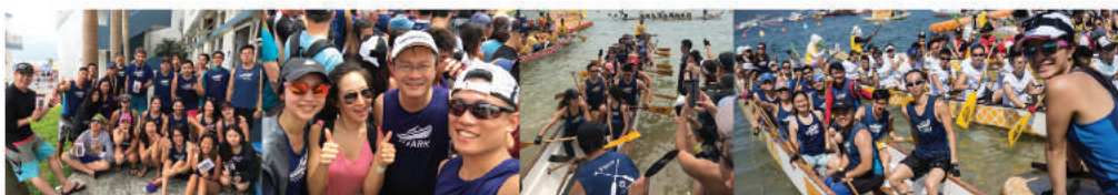
The Ark on Race Day

Disordered eating can take many forms; it doesn't have to be a full-blown eating disorder to become an obstacle in your life. This 6-week support group is led by a caring professional. 7:30 pm, 8/F Living Room.