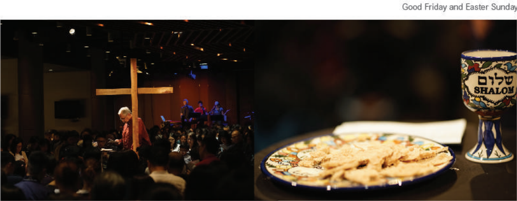
Good Friday and Easter Sunday

Check out www.islandecc.hk , where you’ll have access to information about all our ministries and events, as well as a broad spectrum of resources - including weekly blog posts and video podcasts of sermons.