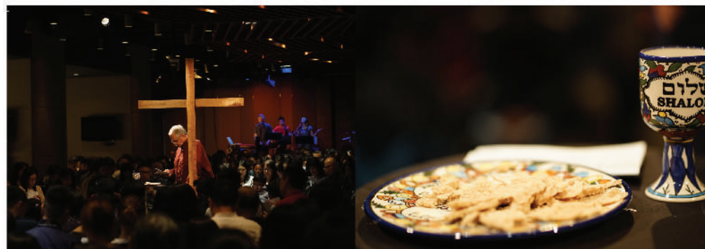
Good Friday and Easter Sunday

✂ TEAR OFF THIS CORNER AND PLACE INTO THE OFFERING BAG Want to learn more about us? Name _____ Email _____ Phone _____