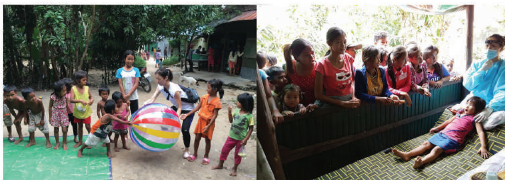
Medical Cambodia Mission Trip

✂ TEAR OFF THIS CORNER AND PLACE INTO THE OFFERING BAG Want to learn more about us? Name _____ Email _____ Phone _____