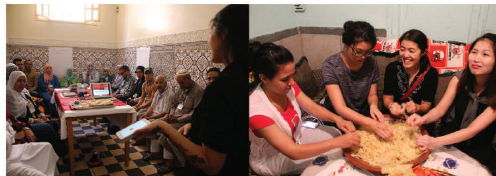
Morocco Mission Trip

✂ TEAR OFF THIS CORNER AND PLACE INTO THE OFFERING BAG Want to learn more about us? Name _____ Email _____ Phone _____