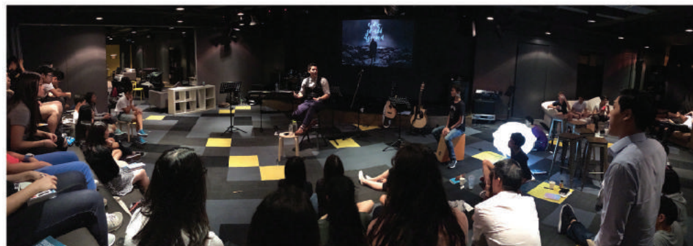
High School and Middle School retreat

Check out www.islandecc.hk , where you'll have access to information about all our ministries and events, as well as a broad spectrum of resources - including weekly blog posts and video podcasts of sermons.