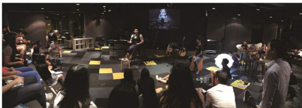
High School and Middle School retreat

Check out www.islandecc.hk , where you'll have access to information about all our ministries and events, as well as a broad spectrum of resources - including weekly blog posts and video podcasts of sermons.