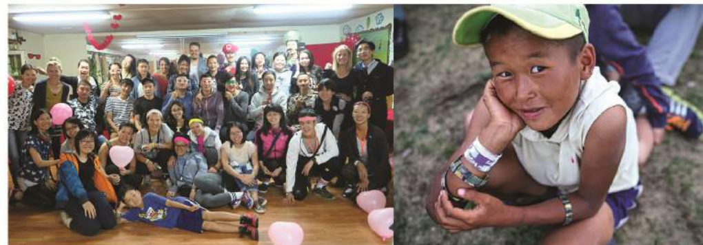
Mission trip to Mongolia

2 Check out www.islandecc.hk, where you'll have access to information about all our ministries and events, as well as a broad spectrum of resources - including weekly blog posts and video podcasts of sermons.