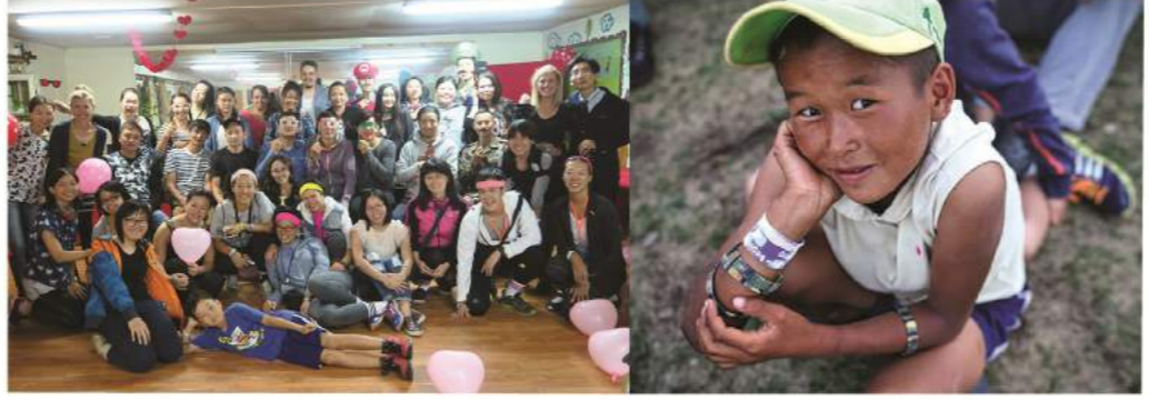
Mission trip to Mongolia

Check out www.islandecc.hk , where you'll have access to information about all our ministries and events, as well as a broad spectrum of resources - including weekly blog posts and video podcasts of sermons.