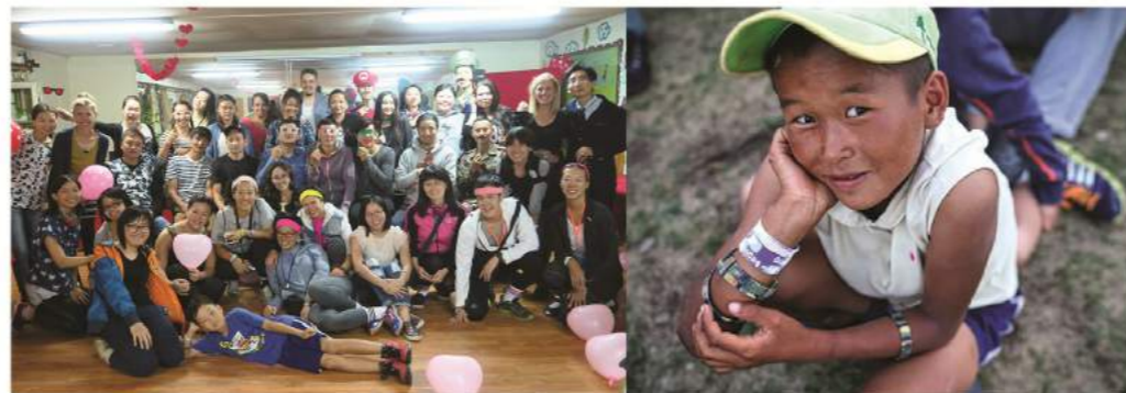
Mission trip to Mongolia

Check out www.islandecc.hk , where you'll have access to information about all our ministries and events, as well as a broad spectrum of resources - including weekly blog posts and video podcasts of sermons.