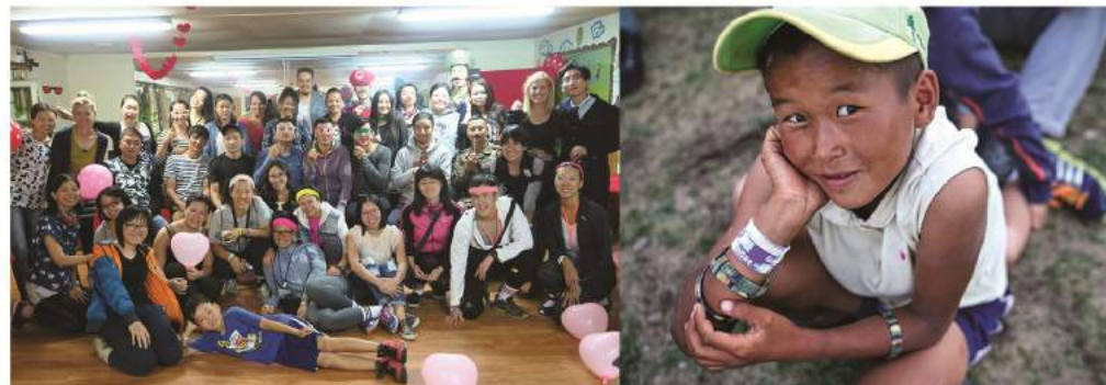
Mission trip to Mongolia

2 Check out www.islandecc.hk , where you'll have access to information about all our ministries and events, as well as a broad spectrum of resources - including weekly blog posts and video podcasts of sermons.