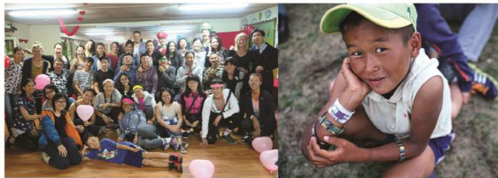
Mission trip to Mongolia

Check out www.islandecc.hk , where you'll have access to information about all our ministries and events, as well as a broad spectrum of resources - including weekly blog posts and video podcasts of sermons.