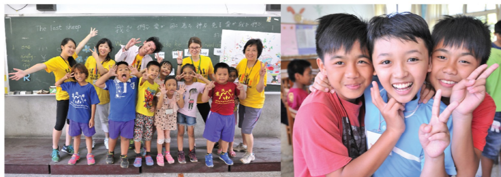
Mission trip to Taiwan