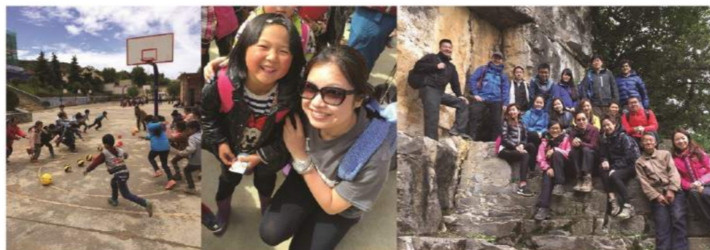
Mission trip to Yunnan