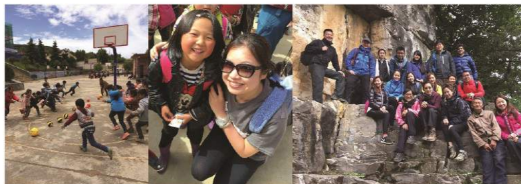
Mission trip to Yunnan