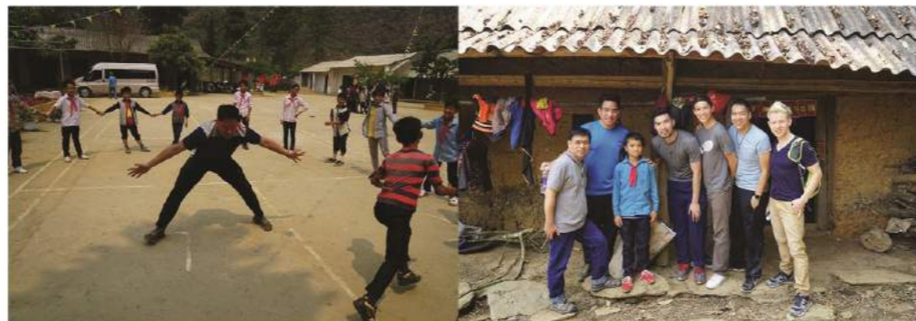
Men's mission trip to Bac Ha in Vietnam