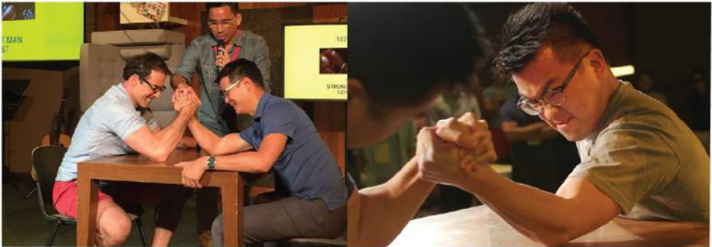
The Indispensables: A One-Day Intensive for Men