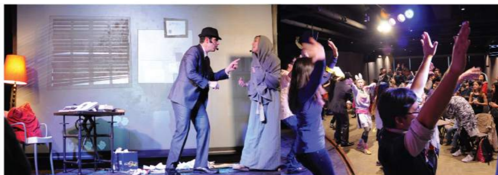
Kids Club FX (Quarterly Family Experience): Easter Celebration

2 Check out www.islandecc.hk , where you'll have access to information about all our ministries and events, as well as a broad spectrum of resources - including weekly blog posts and video podcasts of sermons.