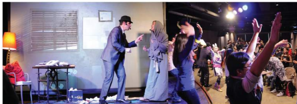
Kids Club FX (Quarterly Family Experience): Easter Celebration

2 Check out www.islandecc.hk , where you'll have access to information about all our ministries and events, as well as a broad spectrum of resources - including weekly blog posts and video podcasts of sermons.