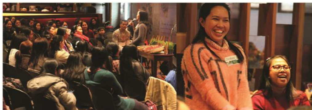
Filipino Ministry's annual Beloved Conference over Chinese New Year