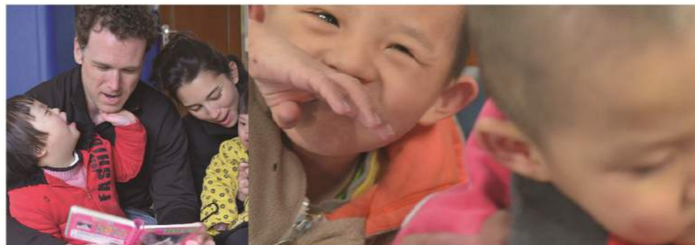
Bi-monthly Shenzhen orphanage visit

2 Check out www.islandecc.hk , where you'll have access to information about all our ministries and events, as well as a broad spectrum of resources - including weekly blog posts and video podcasts of sermons.