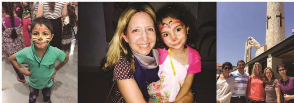
The School at True Vine Church in Lebanon

2 Check out www.islandecc.hk, where you'll have access to information about all our ministries and events, as well as a broad spectrum of resources - including weekly blog posts and video podcasts of sermons.