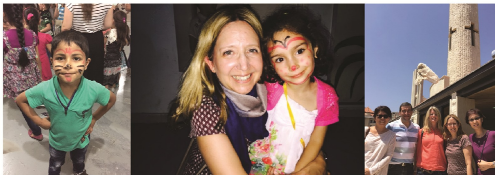
The School at True Vine Church in Lebanon

2 Check out www.islandecc.hk, where you'll have access to information about all our ministries and events, as well as a broad spectrum of resources - including weekly blog posts and video podcasts of sermons.