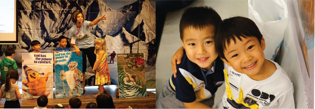
Children's Ministries VBS (Vacation Bible School)

Check out www.islandecc.hk , where you'll have access to information about all our ministries and events, as well as a broad spectrum of resources - including weekly blog posts and video podcasts of sermons.