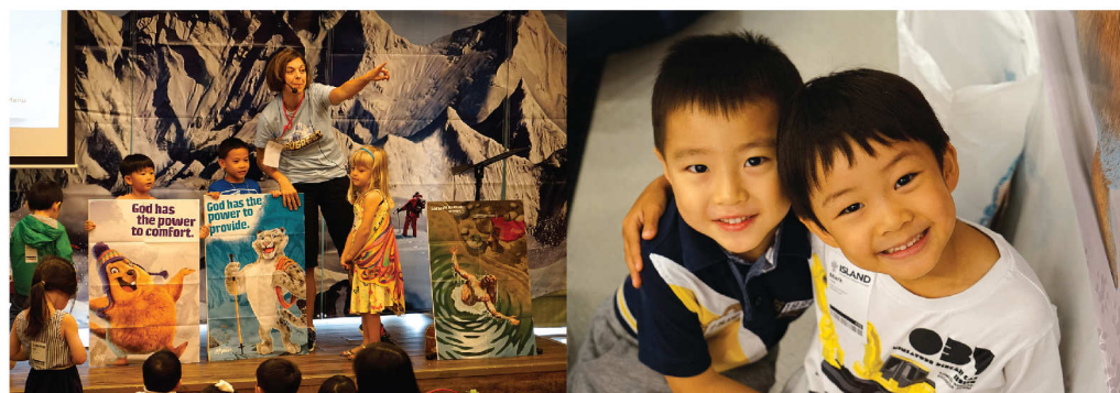
Children's Ministries VBS (Vacation Bible School)

2 Check out www.islandecc.hk , where you'll have access to information about all our ministries and events, as well as a broad spectrum of resources - including weekly blog posts and video podcasts of sermons.