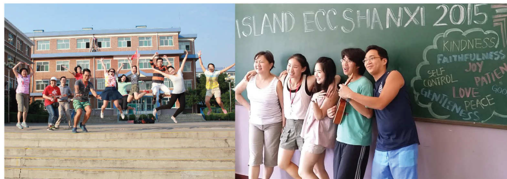
Mission Trip to Shanxi

You can tell God you accept Him now. “Father, I believe you love me. You gave your one and only Son so I can live forever with you. Apart from you, I die. With you, I live. I choose life. I choose you.”