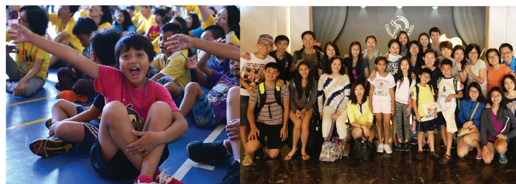
Mission Trip to Taiwan