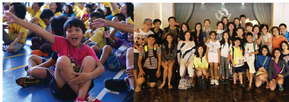
Mission Trip to Taiwan

"Father, I believe you love me. You gave your one and only Son so I can live forever with you. Apart from you, I die. With you, I live. I choose life. I choose you."