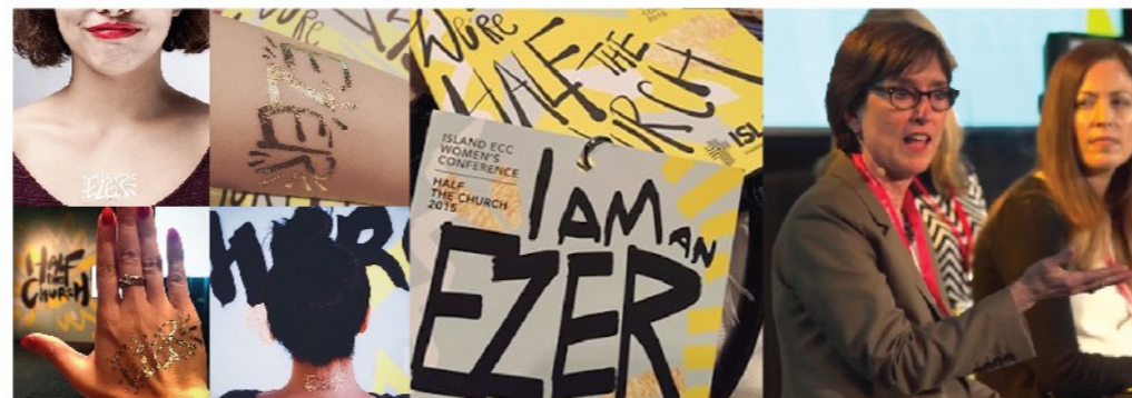
Women's Conference 2015 Half the Church

You can tell God you accept Him now. "Father, I believe you love me. You gave your one and only Son so I can live forever with you. Apart from you, I die. With you, I live. I choose life. I choose you."