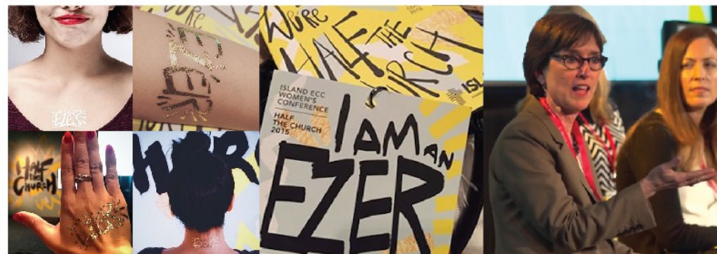
Women's Conference 2015 Half the Church

You can tell God you accept Him now. "Father, I believe you love me. You gave your one and only Son so I can live forever with you. Apart from you, I die. With you, I live. I choose life. I choose you."