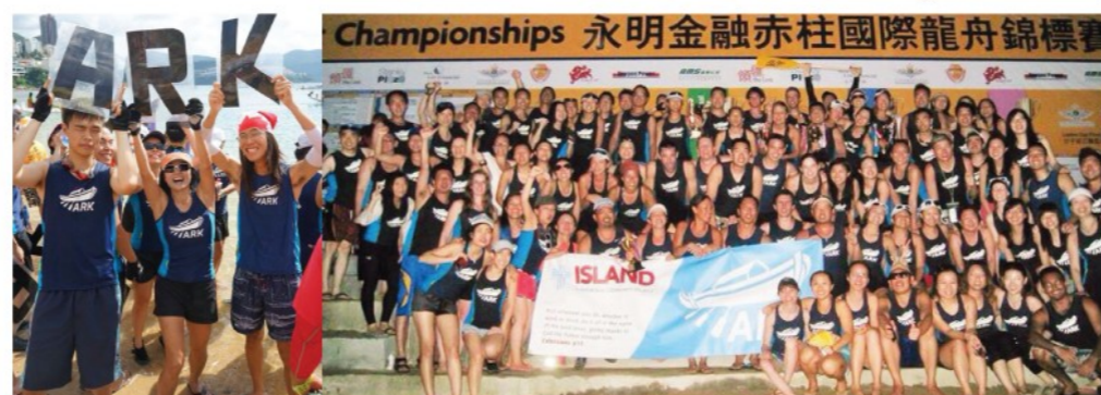
"The Ark" The Island ECC Dragon Boat on race day

"Father, I believe you love me. You gave your one and only Son so I can live forever with you. Apart from you, I die. With you, I live. I choose life. I choose you."