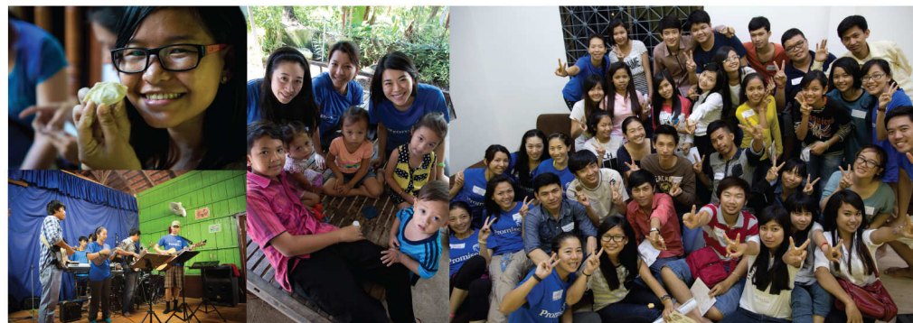
Cambodia Mission Trip