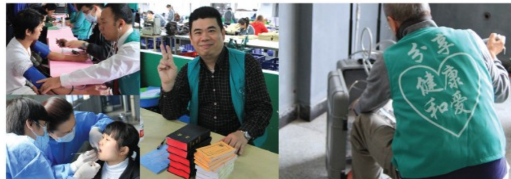
photos: Medical Mission trip to Xiamen

"Father, I believe you love me. You gave your one and only Son so I can live forever with you. Apart from you, I die. With you, I live. I choose life. I choose you."