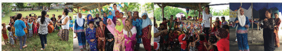
Kairos Philippines Mission Trip (Filipino Ministry)

Every marriage is unique. Making marriage work can be demanding, but worth the effort to keep marriage vital. This class uses a small group structure with videos, guidebook, and discussion to help enrich any marriage. Sunday, 9 April, 11:30 am - 1 pm, 7/F Classroom.