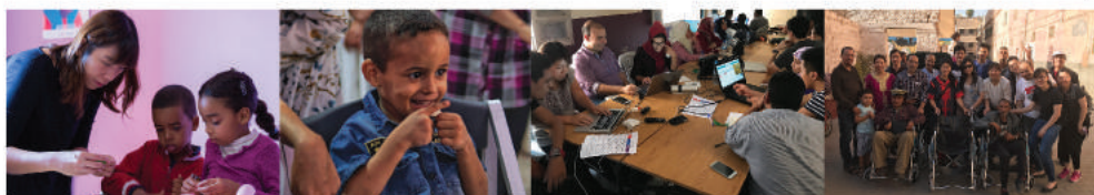
Morocco Mission Trip

Join us in this life-changing course to discover God's approach to managing finances and how that can strengthen our marriages. Topics include: building a healthy marriage; giving, saving and investing decisions; understanding the impact of debt in your marriage; resolving conflicts; setting goals; and more. 9:30 - 11 am, 7/F Classroom. Cost of materials: $600 per couple.