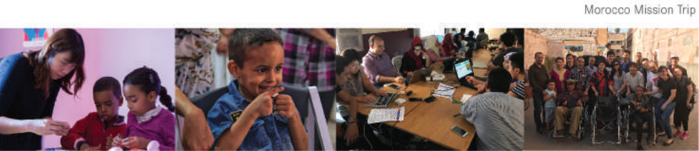
Morocco Mission Trip

✂ TEAR OFF THIS CORNER AND PLACE INTO THE OFFERING BAG Want to learn more about us? Name _____ Email _____ Phone _____