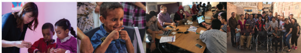
Morocco Mission Trip